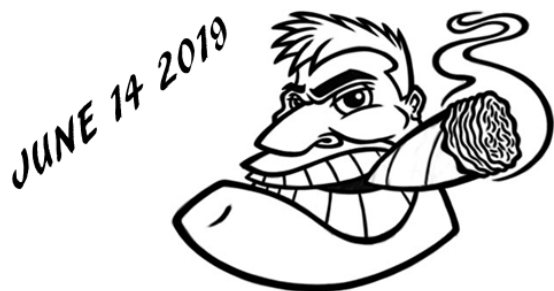
CIGAR KNIGHT 2 BACK FROM THE ASHES

Our collections for our Intellectual Disabilities Drive will come to a close at the end of May. The purpose for this is for us to have a chance to discuss at our June meeting to which Charities to distribute the funds to.